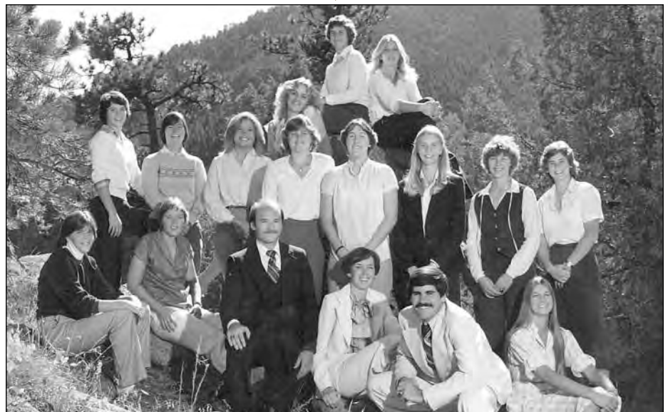
Rene Portland's 1979-80 team was Colorado's first to be nationally ranked.

March 13, 1995 —Colorado is voted the second-ranked team in the country in the final Associated Press poll of the 1994-95 season. It is the highest ranking in the program's and