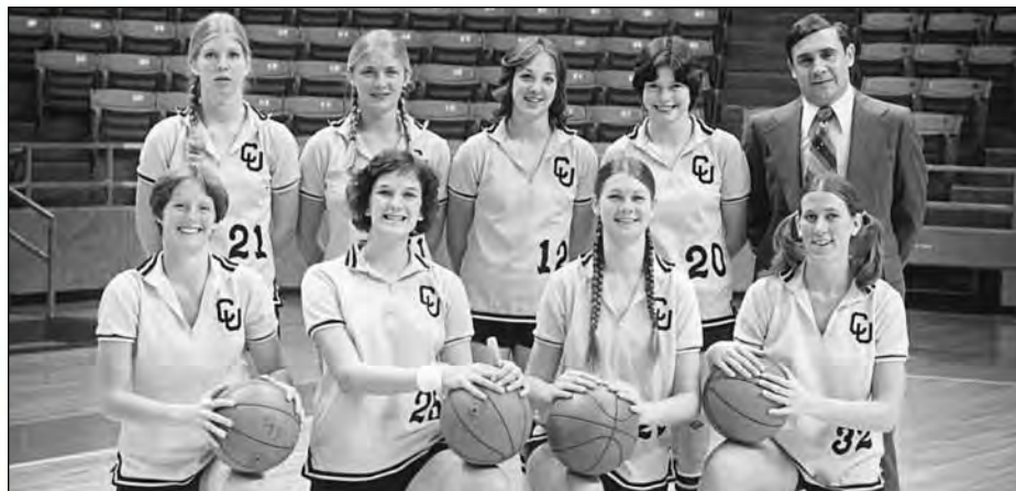
Colorado's 1977-78 team was its winningest to date, with an 18-14 mark.