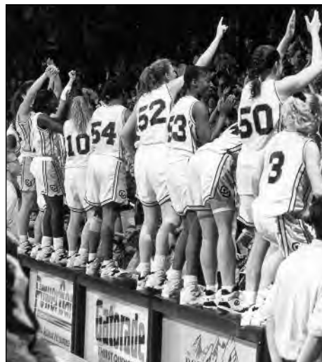
CU celebrates another NCAA Tournament win.